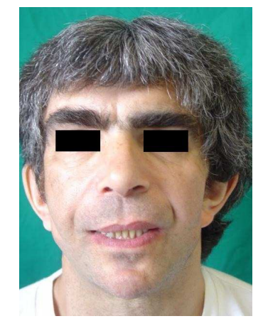
Fig. 10. Frontal view of the patient after treatment

Radiological and clinical exams with Computer Tomography Dental Scan and Telecranium x ray in two projections with cefalometric study were performed to evaluet bony and soft tissues. After 1 month surgery was performed: two fixures with abutment have been positioned in the right mastoid bone, Then the left auricular was positionated to restablish the normal structures of the face. In the same surgical time, two porous polyetylene prosthesis were implanted in the malar region, to restore the sagittal diameter of the middle third of the face; other two porous polyetylene prosthesis were implanted on the more prosthesis was implated on the sinphisis, to restore the transversal and sagittal diameter of the thrid inferior of face. After three mounths an auricular prosthesis associated to Polyacrylamide implant, was positioned in bilateral pre-auricular area (FIGURE 10). Clinical and radiological follow-up demonstrated a good integration of implants and the biomaterial.