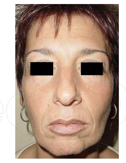
Fig. 5. Frontal view of the patient before treatment