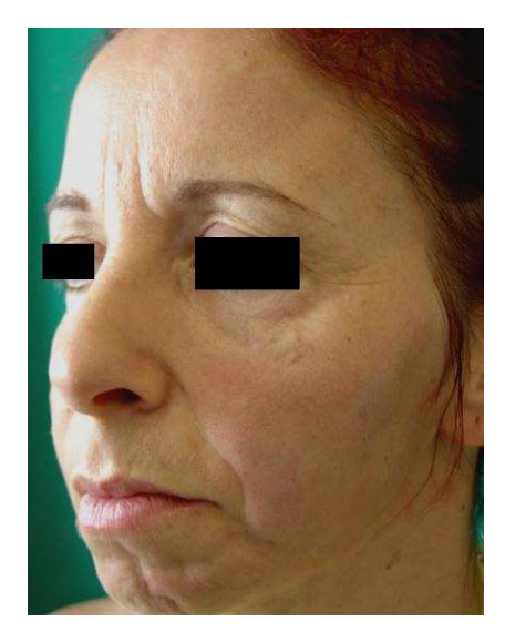
Fig. 2. Lateral view of the patient after treatmet

Therefore the patient underwent to fill of the facial soft tissues with biomaterial. The biomaterial was implanted in the left middle and inferior third of the hemiface; moreover it has been noticed a partial resorption of the biomaterial at the end of treatment. A total of 3 infiltration has been performed for a tot of 8ml of infiltrated biomaterial. (FIGURE 2)